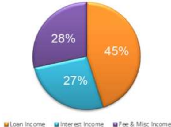
2023 GCFCU Total Gross Income

The pie chart above shows the impact member borrowing has on the credit union's income. Loans account for 45% of our total income which is then returned to our members in the form of lower loan rates, dividends on savings, and outstanding products and services! The credit union continues to provide a safe, convenient place to save and borrow with competitive rates and personal service suited toward your specific needs.